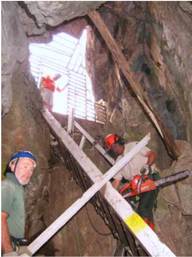
Power caving (?) at the Cotter (PRI).