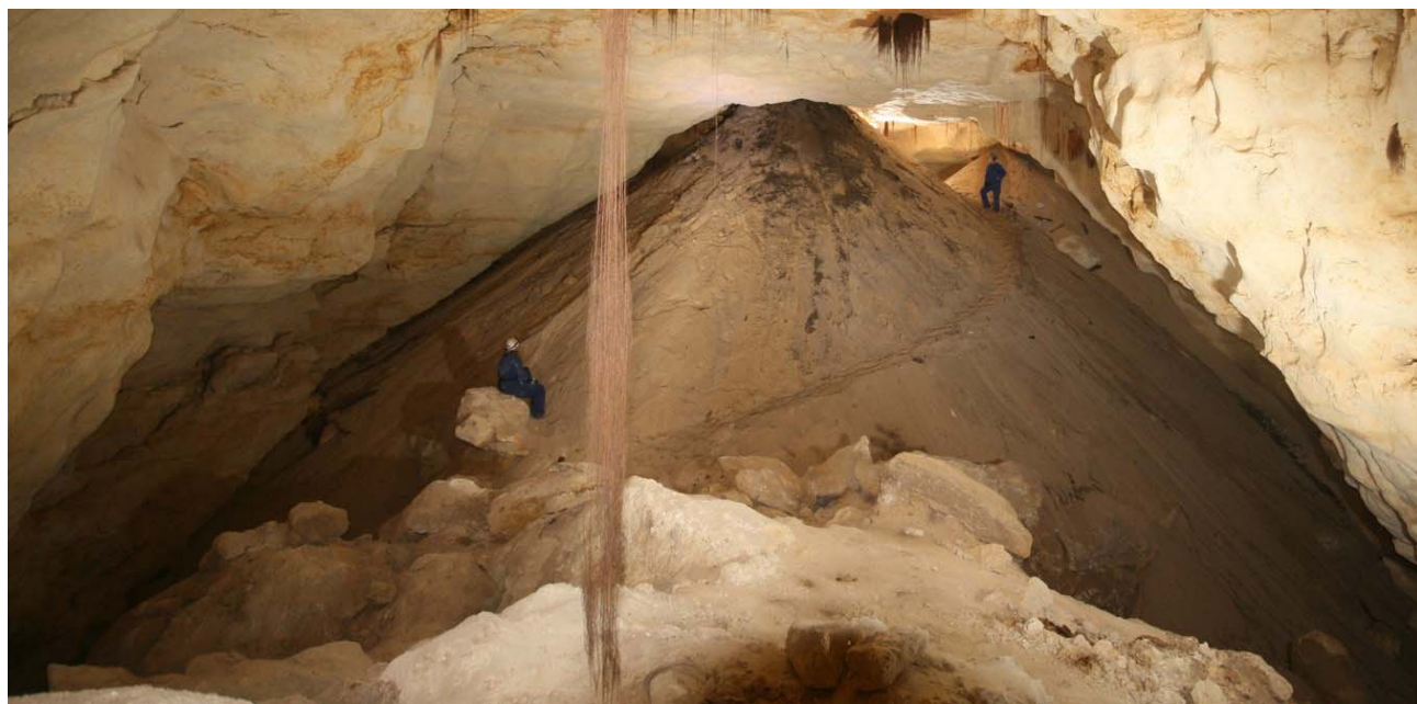
Enormous sediment cones in a cave (Sand Cave - Ed) at Naracoorte. Two people show the scale of the area.

All photos published with the original article were taken by Steve Bourne and are used here with his permission.