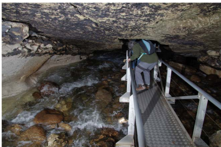
Regina in a low section of the Glowworm Cave.

Our next trip was into the Te Anau Glowworm Cave, a show cave operated by Real Journeys, the company Neil works for. The stream outflow cave is on the western shores of Lake Te Anau about 15km by boat from the Te Anau township. The company no longer allows visitors to take photos in the cave, but our group was permitted to snap away in the lower level – ie in as far as the waterfall. Above the falls, lighting is subdued to allow visitors' eyes to adjust to the almost complete darkness in the glowworm section where we all floated in punts along a dammed section of the cave stream with the glowworms hanging just above us. The glowworm displays are impressive and go close to rivalling some of the best known at Waitomo. Te Anau Cave is only about 200m long and the time spent underground on a normal tour is quite short.