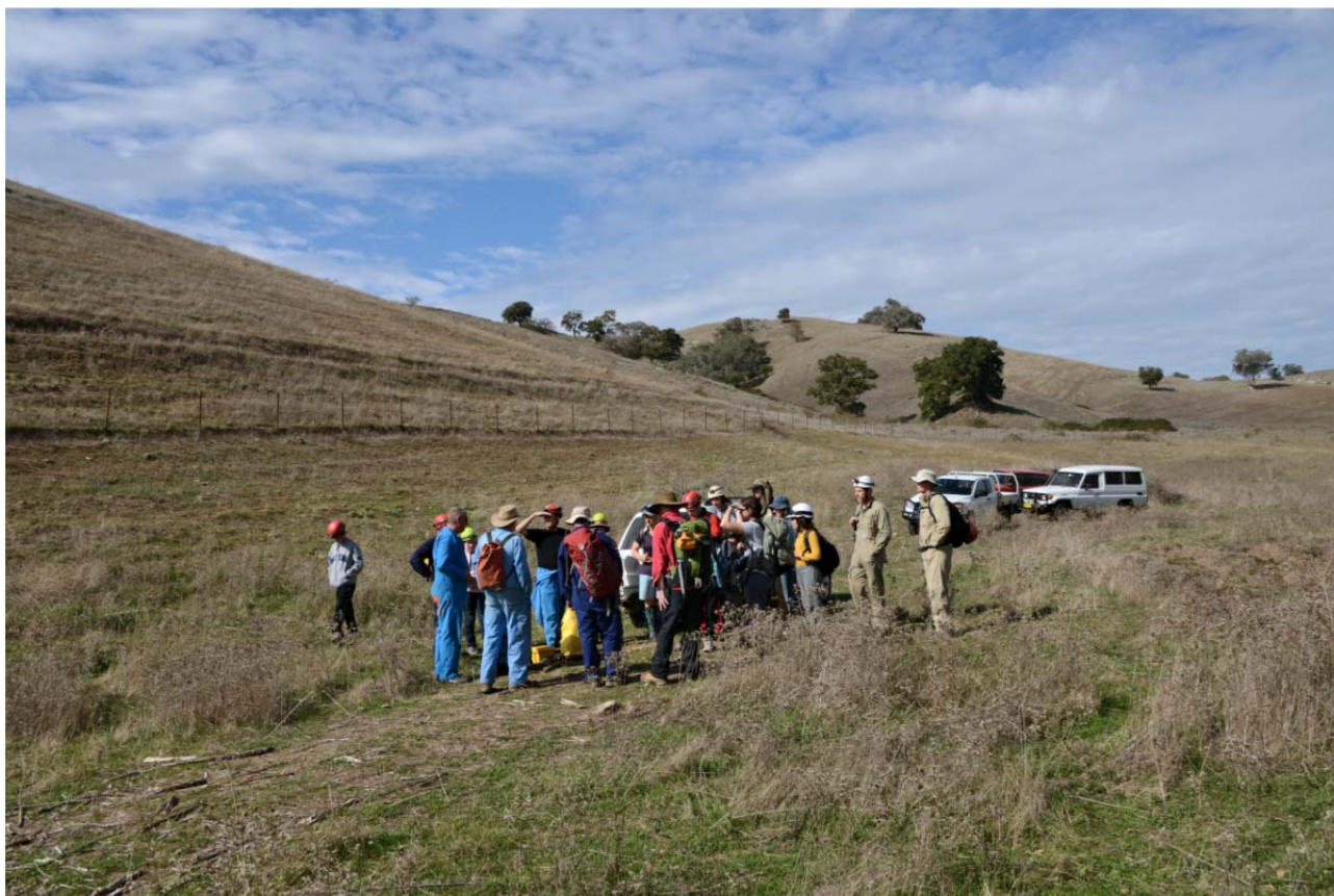
The assembling multitude (Dirk Stoffels pic).