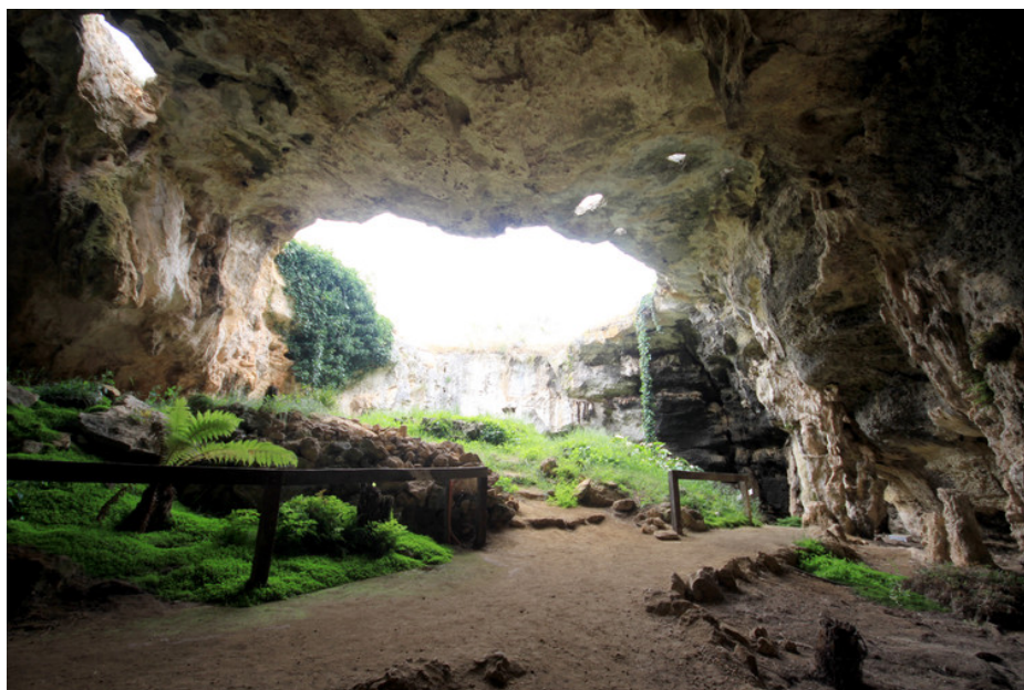
Large roof-window entrance in the spectacular Blanche Cave, Naracoorte. It is in this cave that the first fossil bones were discovered by Woods in 1857.

Moving forwards, new funding has just been announced on a project to establish benchmark data on past ecological and environmental change that is trapped in the structures at Naracoorte Caves.