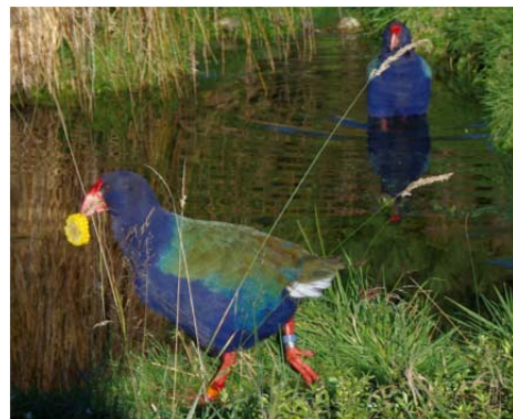
Takahe pair at Te Anau.

Most parts of cave that we visited were quite spacious, had walls of pale cream bedrock and the floor was either breakdown slabs or glacial debris, ranging in size from fine silt to rounded boulders up to 2m in diameter. There were also remnant deposits of glacial fill on ledges high in the roof indicating that at times in its past, the cave must have been completely filled with these sediments. Other impressive features that we saw included the 5m high Twin Falls where the stream has cut right through the limestone to the more resistant underlying sandstone layer. In the passage leading to the Goldmine, the stream has also run out of limestone and flows down the steeply inclined upper surface of the sandstone.