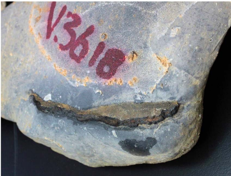
A placoderm bone in limestone from Wee Jasper, before acid treatment.