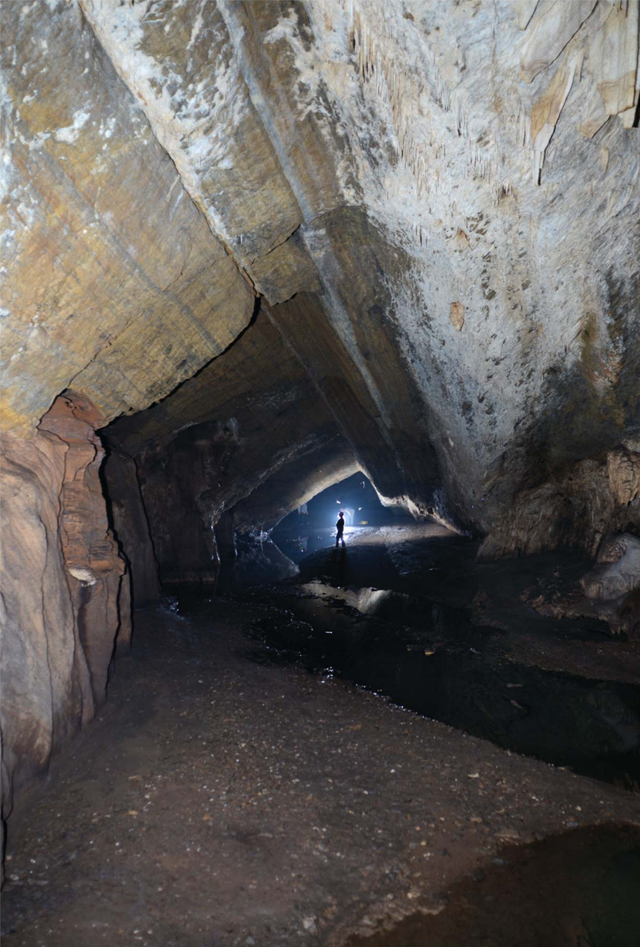
The upstream end of Narrangullen Cave.