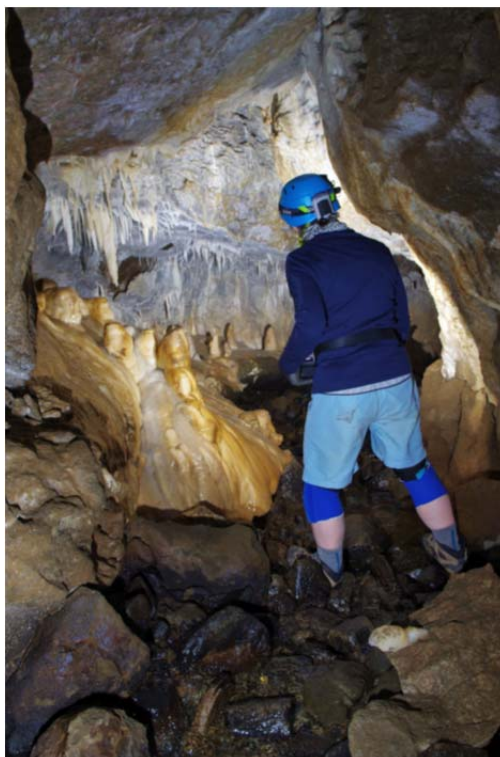
Decoration in Luxless Cave.