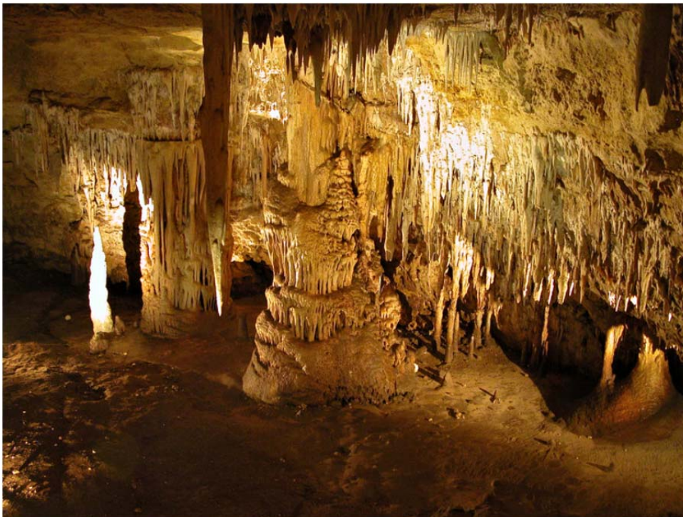
Alexandra Cave, Naracoorte Caves National Park.

Associated calcite formations (such as stalagmites) have preserved critical information on past climate. For example, past rainfall can be determined by studying the fine growth layers within the formations.