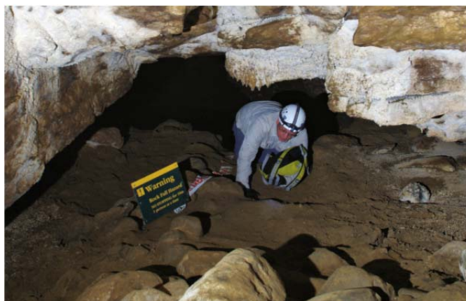
Dirk passing beneath The Rock of Death.