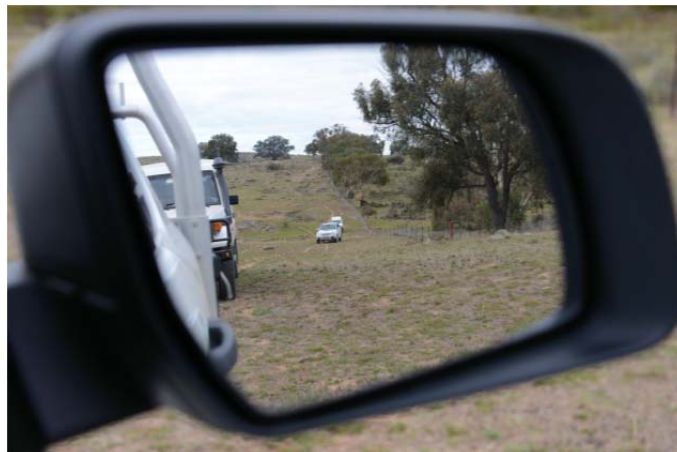
En route to the cave.

On 23 April 2017, CSS visited Narrangullen Cave for the first time since 2006. In the interim, there had been a change of Manager and an apparent relaxing in the requirement that all vehicles entering the property had to be diesel-engined to avoid, we were told, the risk of hot catalytic converters of petrol-engined cars setting fire to the paddocks. In discussions with the Manager when we arrived, it also became apparent that the overland vehicle route to the vicinity of the cave had changed and instead of trying to drive along a farm track that had not been maintained in more than 30 years, the best route was now, in part, across trackless paddocks and then right down into the Cave Creek Valley. Using this route it would be possible to drive to within 100m of the upstream entrance of the cave. However, we chose to park near a fence about 300m away.