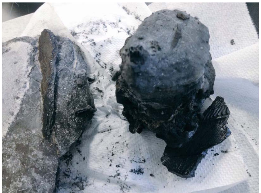
Placoderm bones poking out of rock - midway through acid treatment.

If you think you have found a suspected fossil fish bone while out caving, be sure to get in touch with Dr Young or myself, as these bones are precious, and each new discovery can open up a new window on the life of our ancient vertebrate cousins!