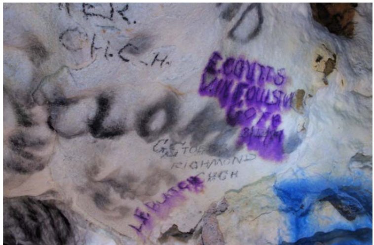
Clifden Cave graffiti, old and new.

The graffiti ranges from historic pencil (lead and indelible) and smoked signatures up to 130 years old to more modern markings using whatever material happened to be at hand, including mud, marking pen, crayon, charcoal, lipstick and spray paint. Some walls in the cave are covered with scratched, or deeply carved, 'engravings'. I talked to groups throughout the day and some very good ideas came forward. In our cleaning trials we used clean cave water (from pressurised spray bottles) and scrubbing brushes and focussed on the modern spray paint, mud markings and mud balls.