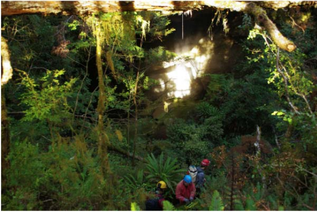
The main entrance to Aurora Cave.